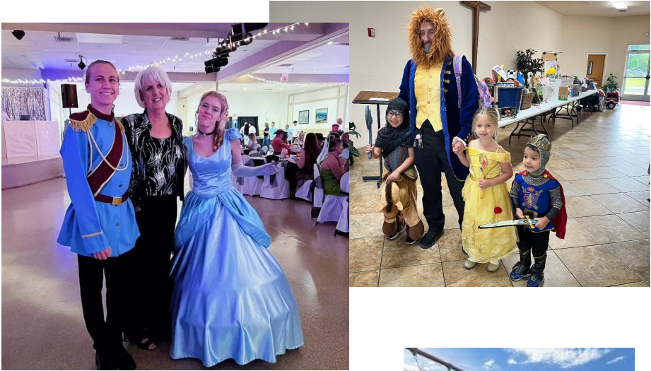
Storybook Gala T is for Travel Special readers & playground friends