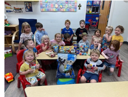
Service project for Animal Shelter